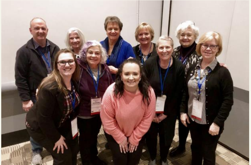
Members of the retired and aspiring educators delegation at the NEA Leadership Summit

The annual NEA Leadership Summit was held in Denver, CO, March 15-17, 2019. The conference was held at the Colorado Convention Center with over 2,000 participants from across the nation. NEA combined the leadership summit (mainly for active members) with the NEA Retired Conference which was held March 17-18 at the Sheraton Denver Downtown. This year's Summit theme was "Amplifying Our Voice: Leading Boldly For Our Students, Our Professions, Our Union."