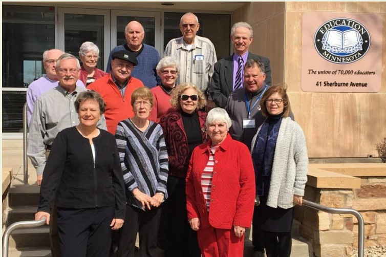
Education Minnesota Retired members join with REAM to make their voices heard at the Capitol.

At this writing, the commission has informed TRA that they will discuss the proposal again on April 12.