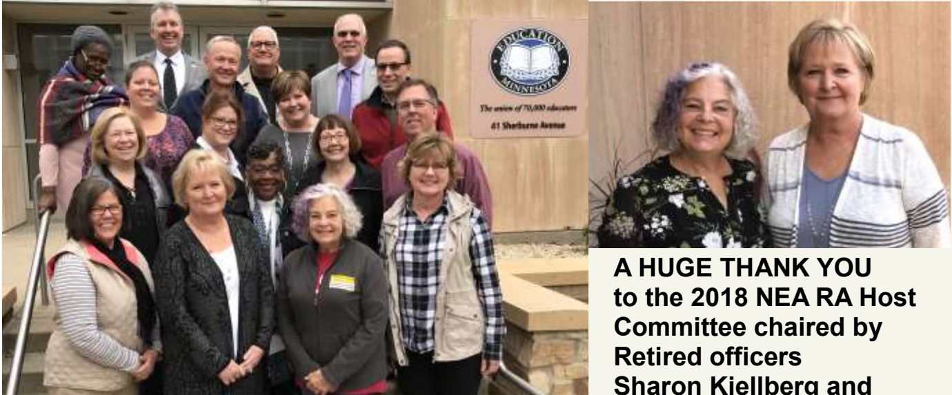
Above: The NEA RA Host Committee