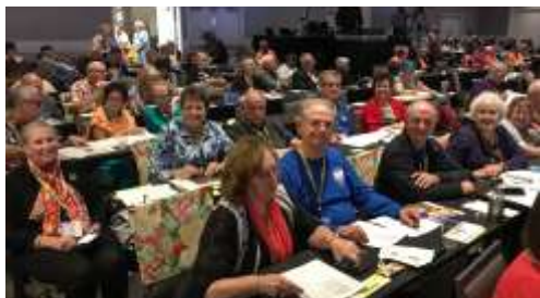
The Minnesota delegation to the NEA Retired Annual Meeting in St. Paul.