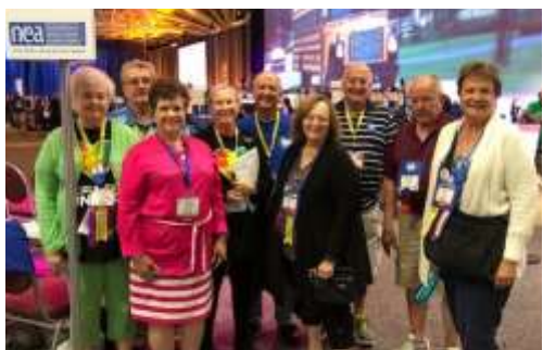
The Minnesota delegation to the NEA RA

The NEA-R meeting adjourned on June 28 and we moved to the Loews Hotel in Minneapolis.